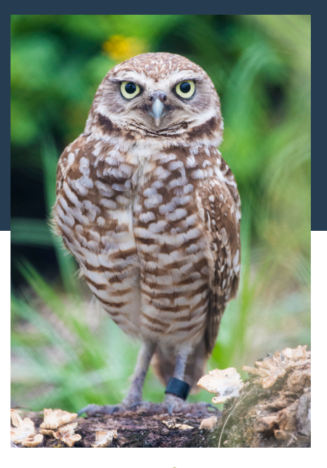
Silver | $5,000

25 one-day admission tickets to Zoo Miami